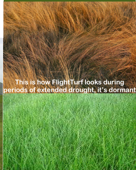
This is how FlightTurf looks during periods of extended drought, it's dormant